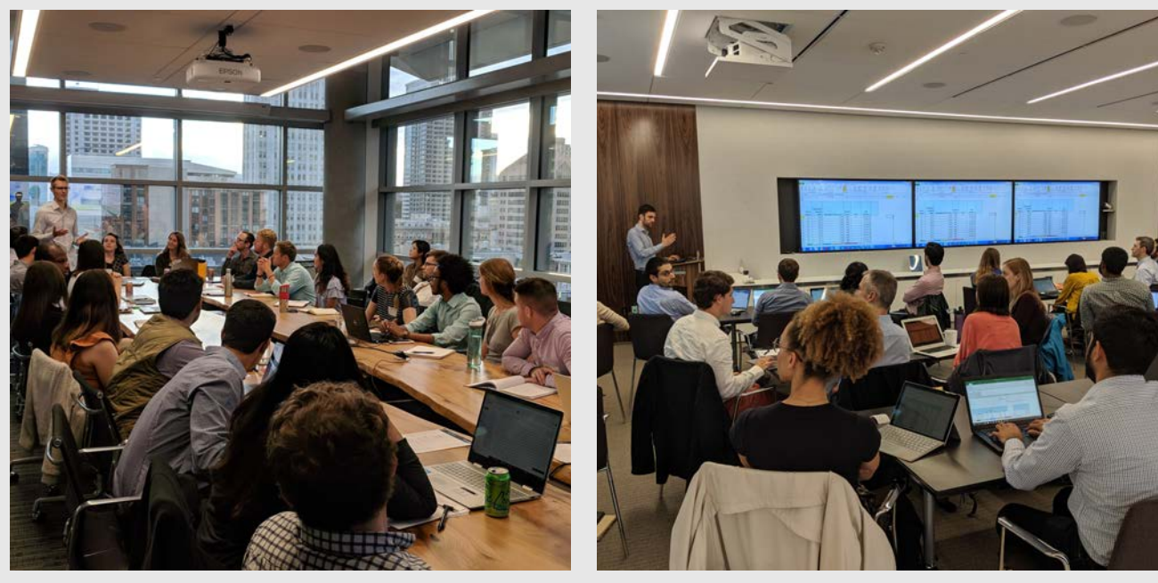
Since its founding in 2013, CELI has trained more than 500 emerging leaders through our flagship Fellowship program, representing 250+ organizations across the clean energy economy.

References: E2, Clean Jobs America Report (2019); Environmental and Energy, Fact Sheet - Jobs in Renewable Energy, Energy Efficiency, and Resilience (2019); NASEO & EFI, The 2019 US Energy and Employment Report (2019)